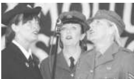
The Sirens singing group

cles, an exhibition of artefacts and fun and games for all the family. Prizes too!