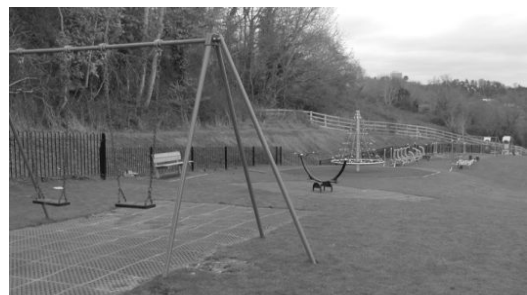
Something which is open:- Clover Avenue and Lavender Road Park. Almost finished—Already Open