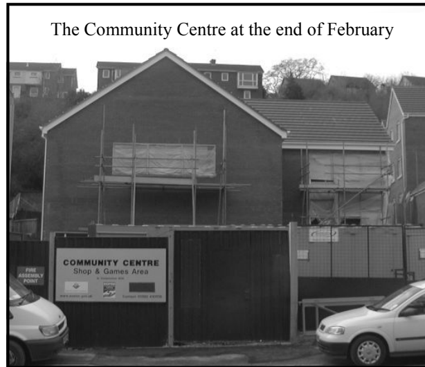
The Community Centre at the end of February

on the running of the new Community Centre which is being built in Kinerton Way. As was reported in the Express and Echo recently the Centre will not now be open before the summer. Due to